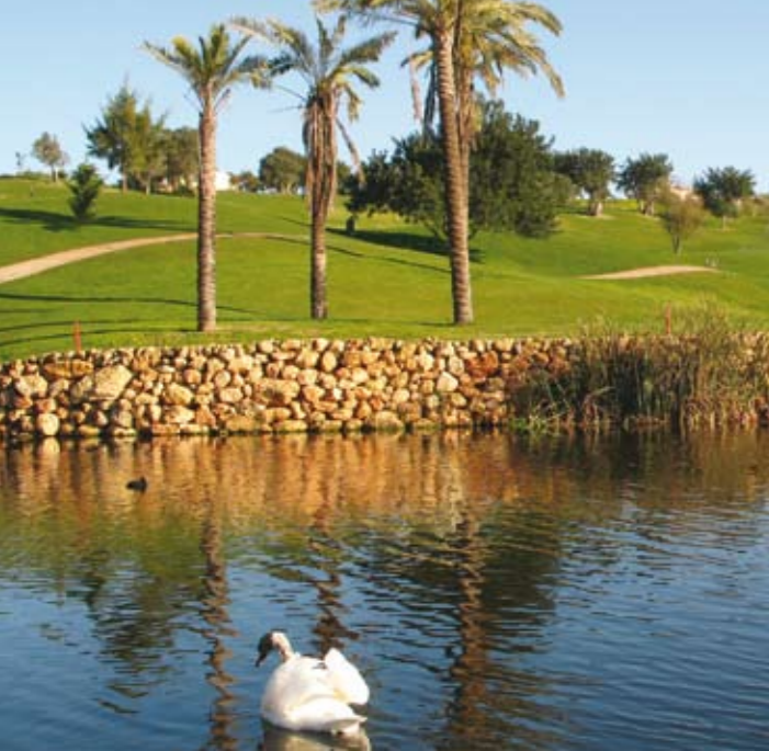
Pestana Gramacho Golf Course