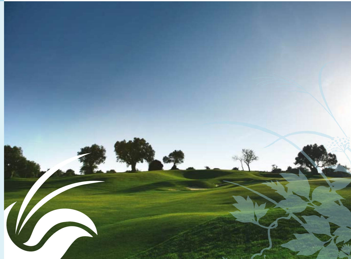
Pestana Vale da Pinta Golf Course

Lush vegetation and an idyllic climate make the Algarve a golfer's paradise, beckoning amateur golfers and the most prestigious players from all over the world. In Carvoeiro, close to Vale da Lapa Parque, Pinta has earned a reputation for its excellent condition and Gramacho, is an 18 hole championship course complete with David Leadbetter Golf Academy. Owners at Vale da Lapa Parque will benefit from preferred discounts and before you set foot on the regions emerald greens perfect your shots and get in some valuable practice at the resort's very own 9 hole putting green.